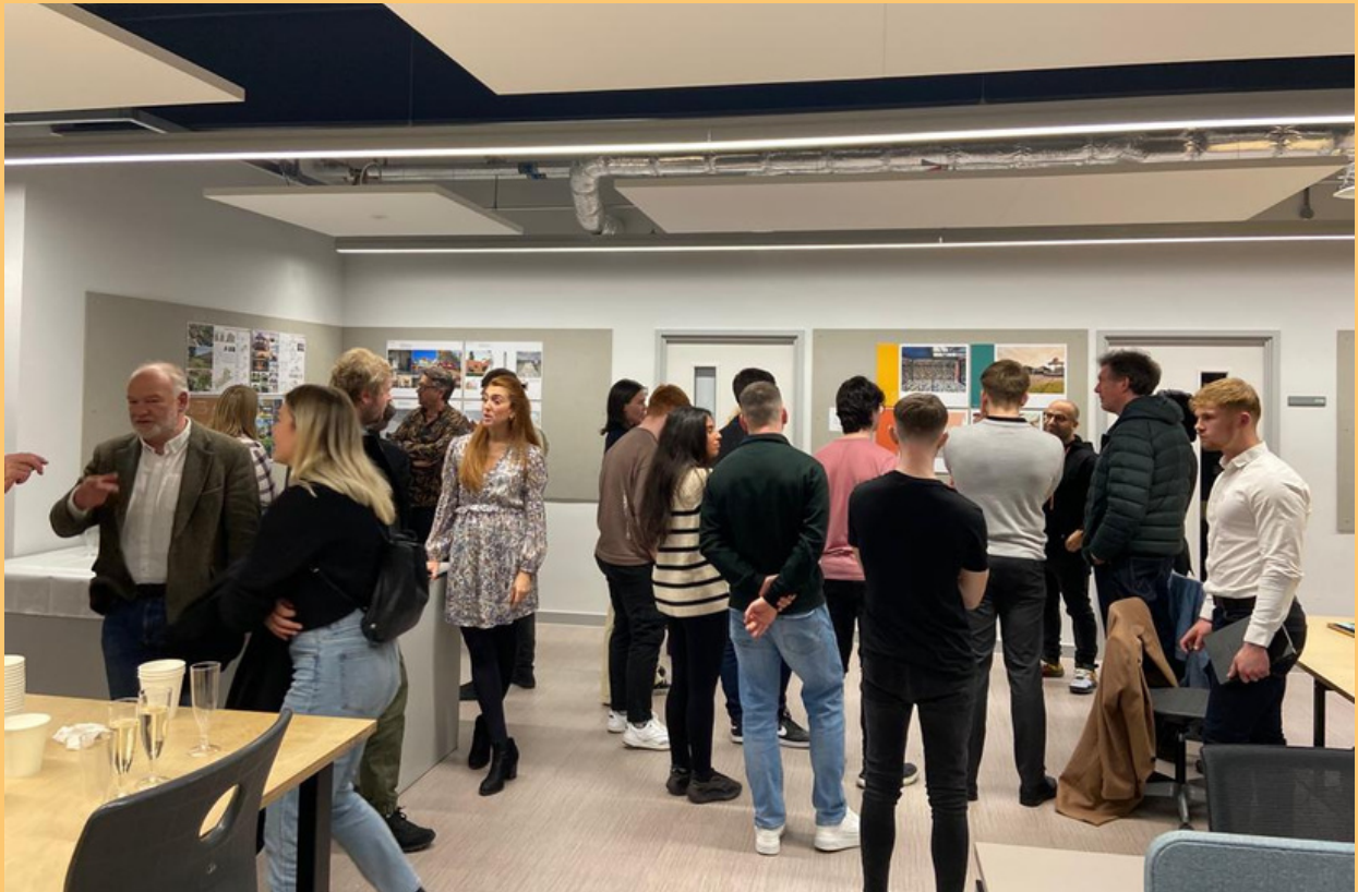
RSAW Practice Exhibition - UWTSO