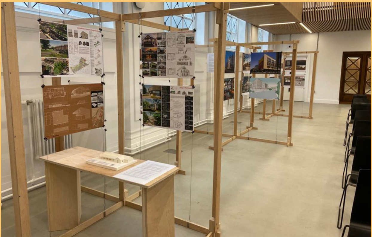
RSAW Practice Exhibition - WSA