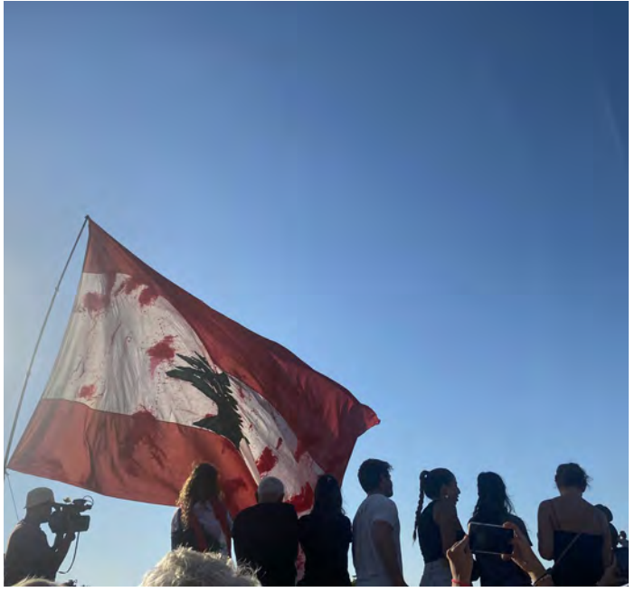
August 4th 2023 Protest.

Our research has yielded several outputs, including: interviews with local stakeholders (film, audio and transcribed copy; please see appendices), photography, archival- and ethnographic research. In terms of outcomes, we are confirmed to give lectures and seminars at the following British architecture faculties: Central Saint Martins College of Art and Design (3 seminars confirmed for the 23/24 academic year), London School of Architecture (1 public event confirmed for March 2024), London Met (1 seminar confirmed for January 2024), Manchester Metropolitan University (1 seminar confirmed for February 2024). We are also in talks with the LSA and CSM about screening our film at events open to the wider public. Further, we are exploring publishing our interviews in Ephemera, a leading academic journal relating to politics and organisation.