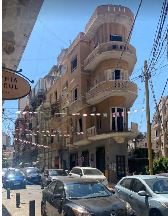
B-series Buildings Credit: Athar Collective