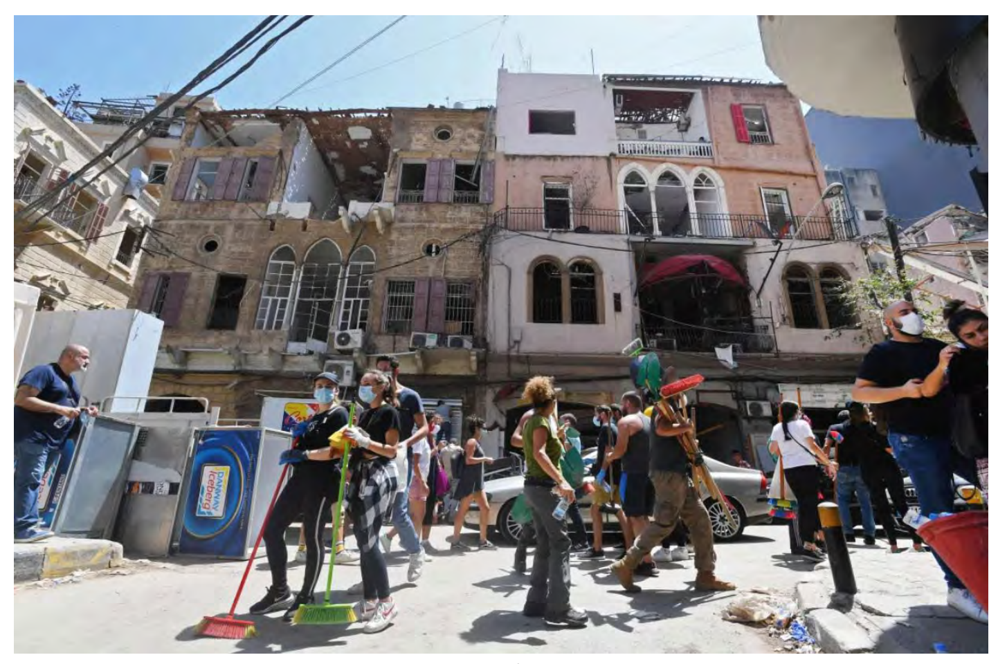
Volunteers clear the rubble in the Gemmayzeh neighborhood of Beirut on Aug. 7, 2020

Our research shows that these practices came together in the surveyed neighbourhoods to form a complex patchwork of mutual aid, resilience, and protest. Developed by local communities and individuals, these practices arguably are particular to Beirut. In its concluding remarks, the report discusses if and how these practices can be transposed to other spatial and social contexts.