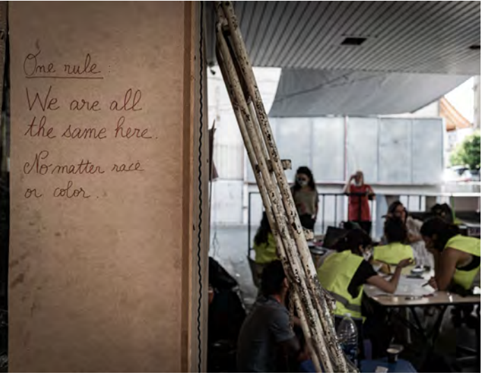
Nation Station set up August 2020.