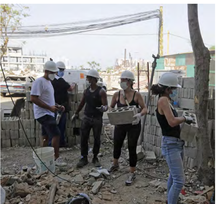
Volunteers help with the renovation of a Beirut flat belonging to an Armenian family.