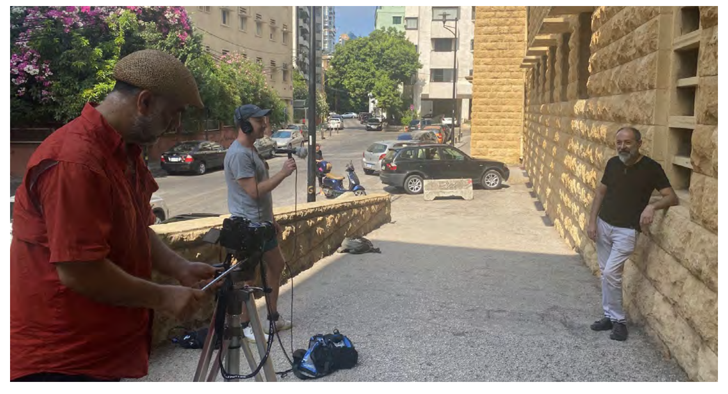
A day of filming in the Achrafieh, Gemmayze and Mar Mikhail neighbourhoods of Beirut.