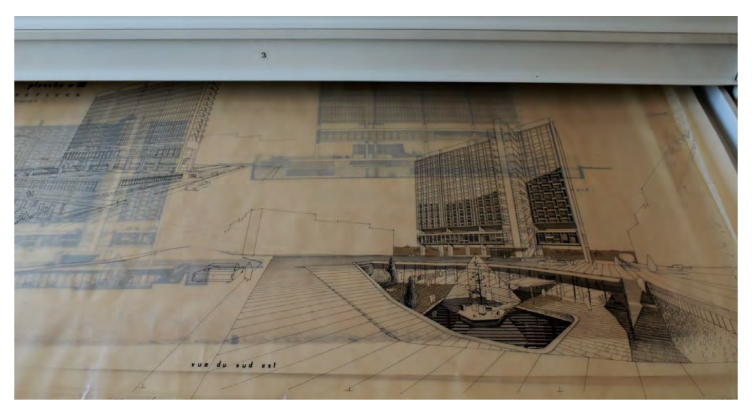
Archival research at the Arab Centre for Architecture.