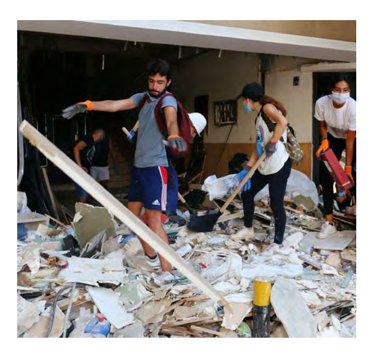
Volunteers clean rubble from the streets following blast.

As a first wave of post-disaster relief, this type of support is critical. It enables communities to establish some degree of order in the chaos of an unfolding crisis, and furthermore builds or consolidates social solidarity between people under extreme pressure. However, uncoordinated individual efforts tend to be inefficient because resources and logistics are managed in a suboptimal way. Campaigns, facilitated by social media, can be a useful way to anchor and streamline such efforts while furthermore providing communities with a sense of agency.