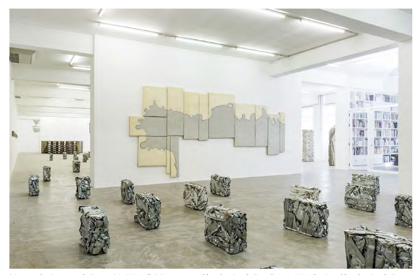
Marwan Rechmaoui, Gallery 6.08, 2020, Exhibition view, Sfeir-Semler Gallery Beirut, 2021