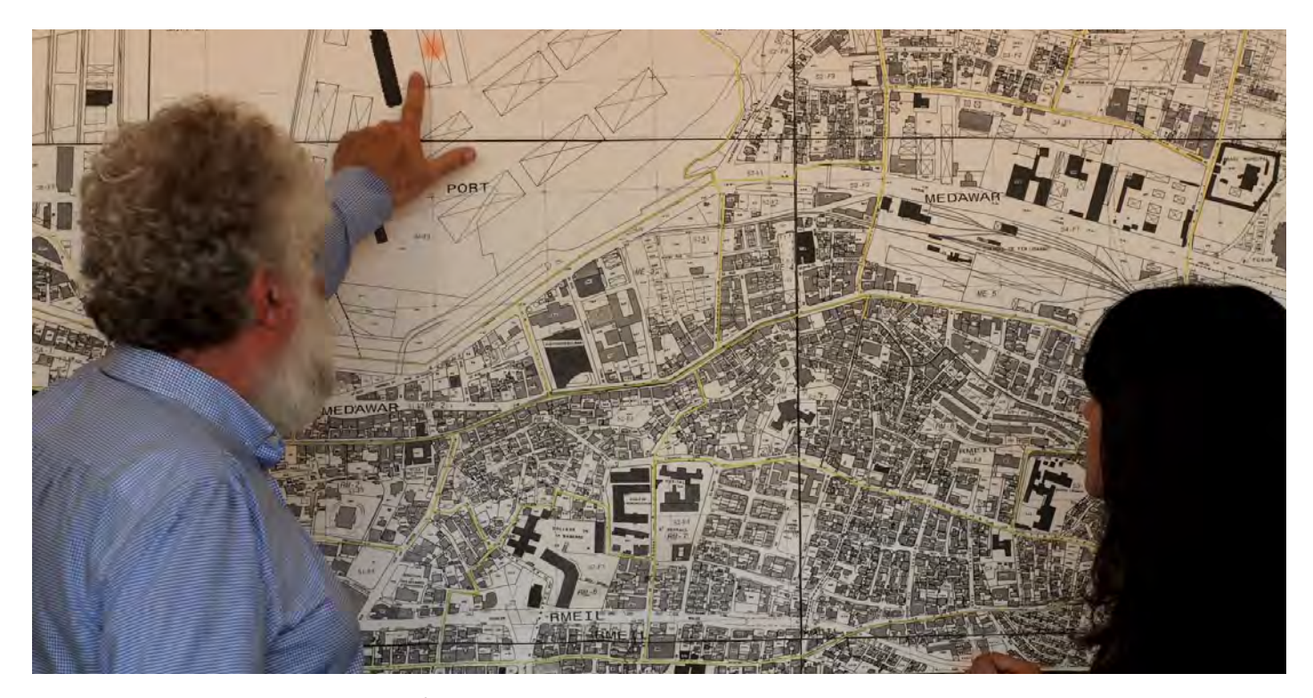
Mapping research at the Arab Centre for Architecture.

We deliberately engaged with a mix of architects, academics, planners, artists and journalists, as we wanted to cover a range of spatial practices, capturing insights in a way that could support facilitation to a wide audience after the trip. We would like to thank all stakeholders and collaborators for their contributions to our research. Without their insights and generosity, the project would not have been possible.