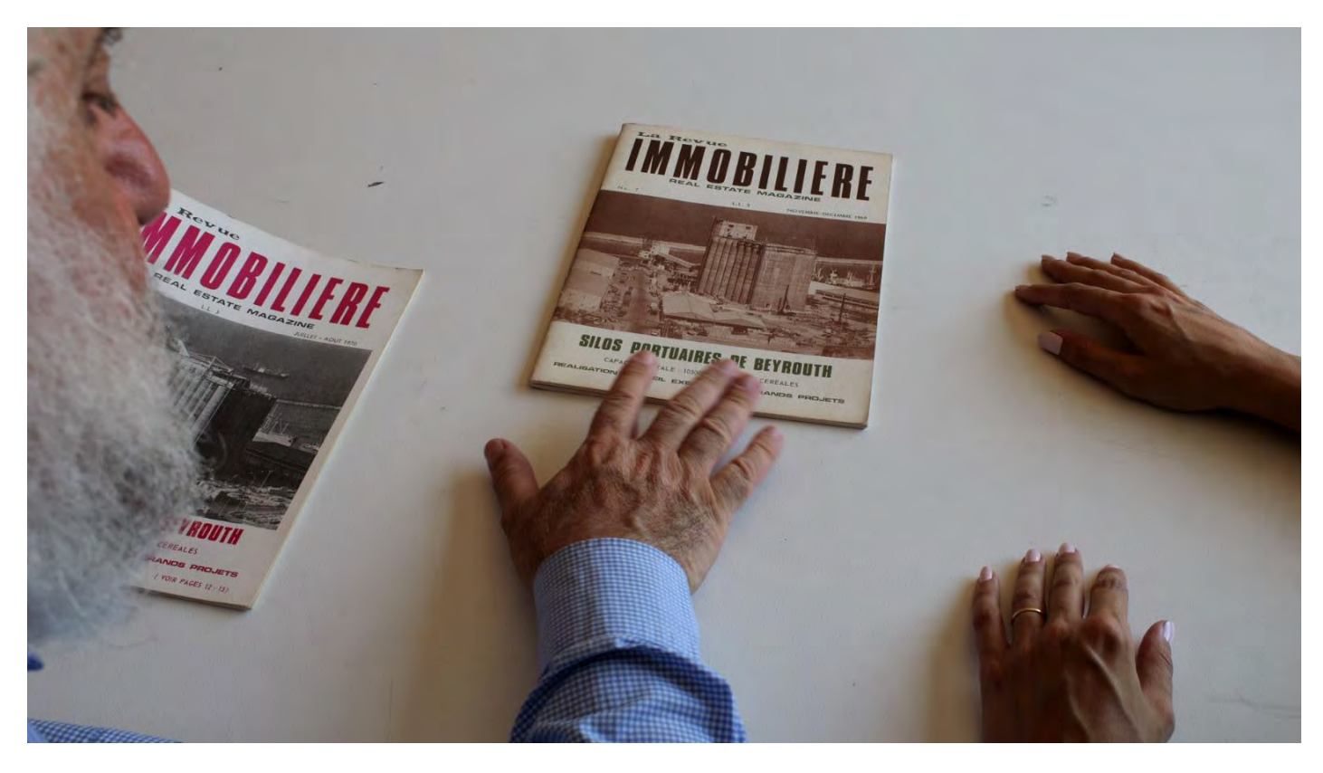
Archival research at the Arab Centre for Architecture.

We have taken a grounded approach to this project. While we had some notions about what the research might touch on when we set out, we have been guided by the data – mainly qualitative – that we gathered in the lead-up to the research trip and in the two weeks spent in Beirut during the first part of August, 2023. In the months prior to the trip, we reached out to stakeholders through our personal and professional networks, to set up consultations with people involved in the response to the disaster; the mix of respondents is discussed below. In addition to gathering preliminary insights, we engaged in consultations to ensure i) that our research would be timely and not duplicate existing research projects, and ii) that we would speak to relevant people – whether architects, planners, heritage experts, activists, artists, or community organisers – once in Beirut