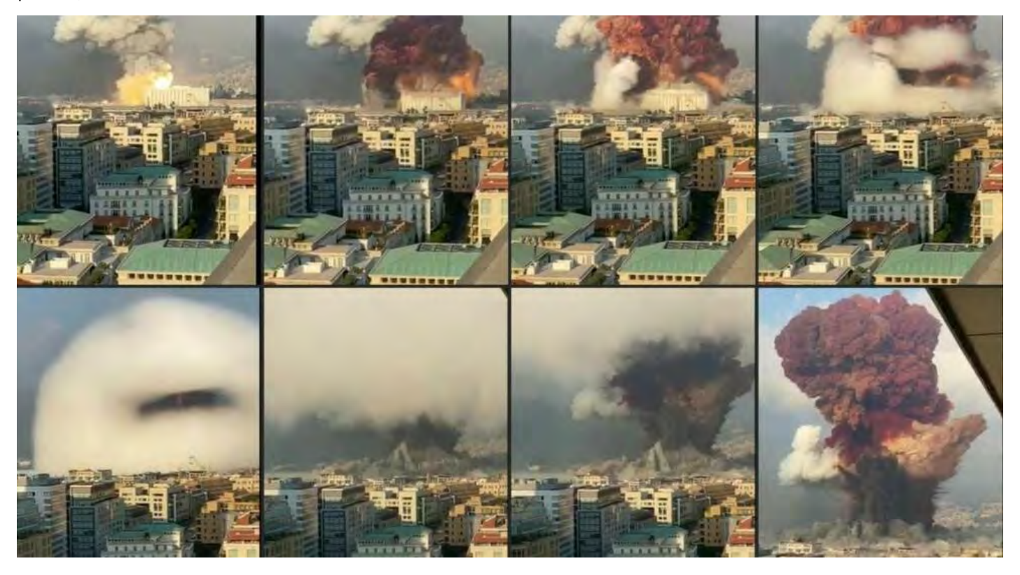
Footage filmed at the moment a massive explosion rocked Beirut at the port of the Lebanese capital on 4 August, 2020.

On 4 August 2020, Beirut was hit by one of the biggest non-nuclear explosions in recorded history. The blast, which originated in warehouse 12 of the Beirut Port, killed more than 220 people, injured over 6,000, and caused damages to the built environment of upwards of $15bn. An estimated 300,000 people were displaced. Our research trip was timed to coincide with the 3-year anniversary of the disaster. No one has yet been held to account for the blast, nor has a formal investigation begun. Indeed, the authorities seem to be delaying any investigative measures, to the frustration of many Lebanese people. The three years since the blast have been characterised by a political vacuum which has highlighted and further exacerbated tensions happening elsewhere in the body politic, often with connections to the Civil War which ended in 1990.