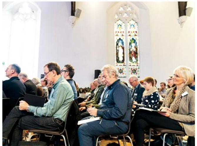
RSAW 26th Annual Conference 2019 / Cynhadledd Flyndyddol RSAW 2019 – y 26ain

With a staff team based in Cardiff, the RSAW Council and members in four Branches, we promote the value of good design through awards schemes, exhibitions, festivals and conferences, regularly working in partnership with other professional bodies and Welsh national organisations. We connect with leading figures in the political and creative arenas through our Honorary Member programme.