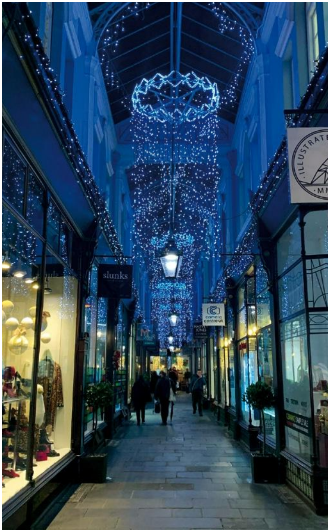
Morgan Arcade, Cardiff / Arcêd Morgân, Caerdydd