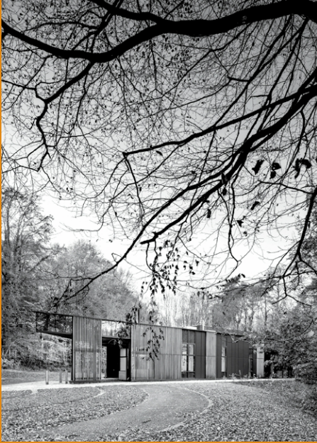
Gweithdy, St Fagans/ Sain Ffagan , Feilden Clegg Bradley Studios