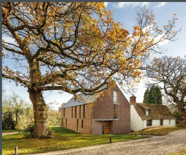
Silver How, Hall + Bednarczyk Architects.

Mae gennym dîm o staff yng Nghaerdydd, Cyngor RSAW ac aelodau mewn pedair Cangen ac rydym yn hyrwyddo gwerth dylunio da trwy gynlluniau gwobrau, arddangosfeydd, gwyliau a chynadleddau, gan gydwethio’n rheolaidd â chyrrff proffesiynol eraill a sefydliadau cenedlaethol yng Nghymru. Rydym yn ymwneud â ffigurau blaenllaw yn y meysydd gwleidyddol a chreadigol trwy ein rhaglen Aelodau er Anrhydedd.