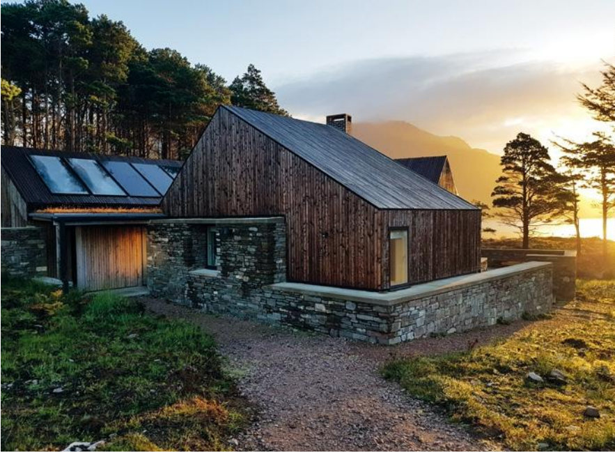
Lochside House, HaysomWardMiller Architects