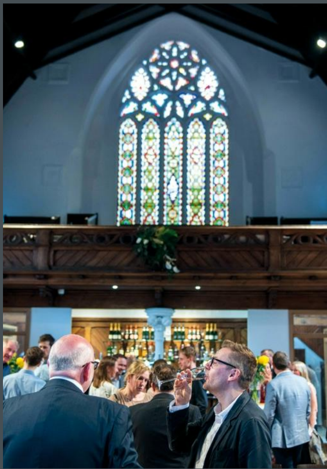
2019 Welsh Architecture Awards ceremony / Seremoni Gwobrau Pensaernïaeth Cymru 2019.