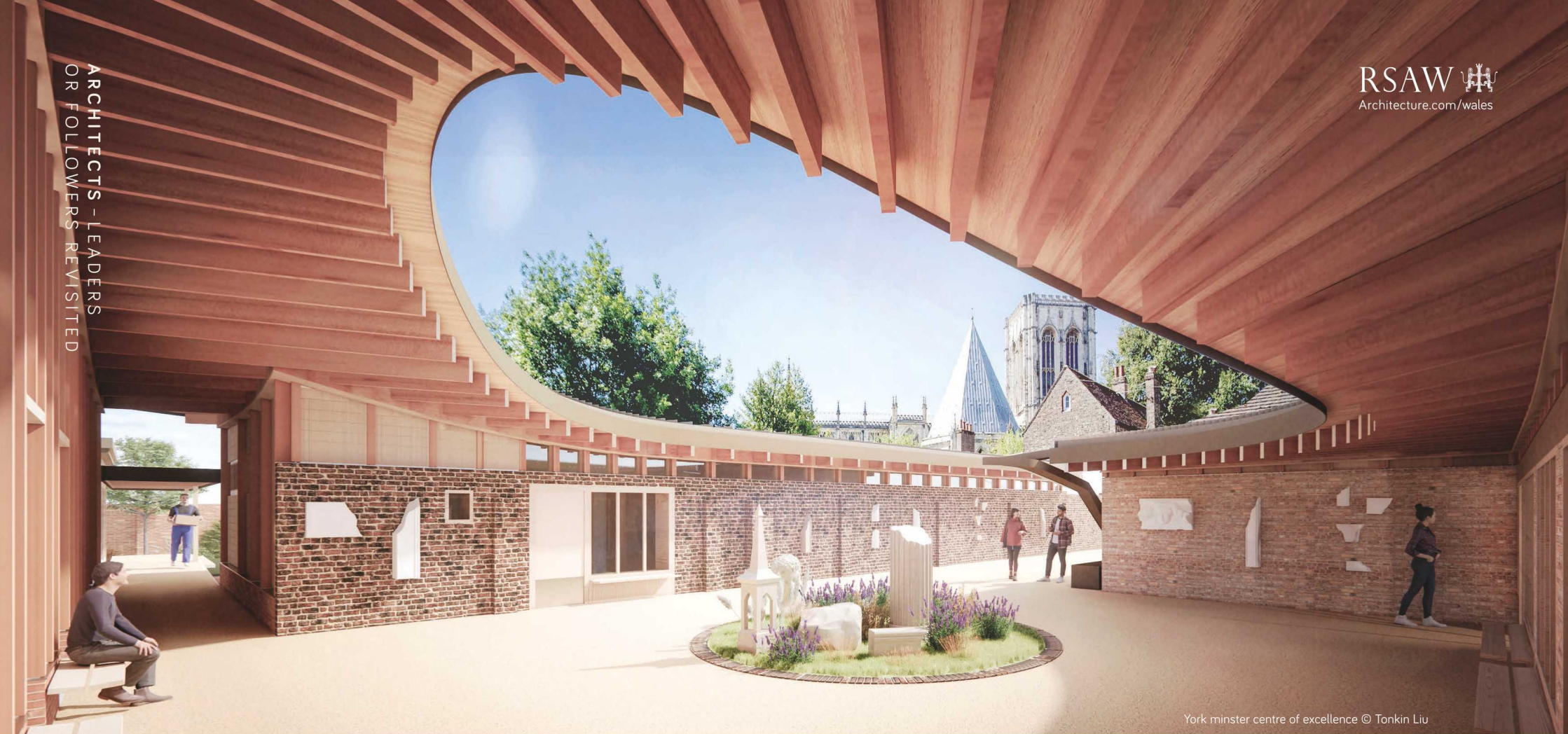
York minster centre of excellence © Tonkin Liu

On 30 November 2023, we will celebrate the 30th RSAW Annual Conference by re-exploring the theme from the first ever conference in 1994: 'Architects - Leaders or Followers: the next ten years'.