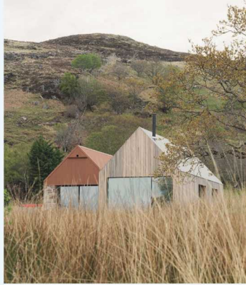
Dualchas: House at Diabeg

ARCHITECTS - LEADERS OR FOLLOWERS REVISITED