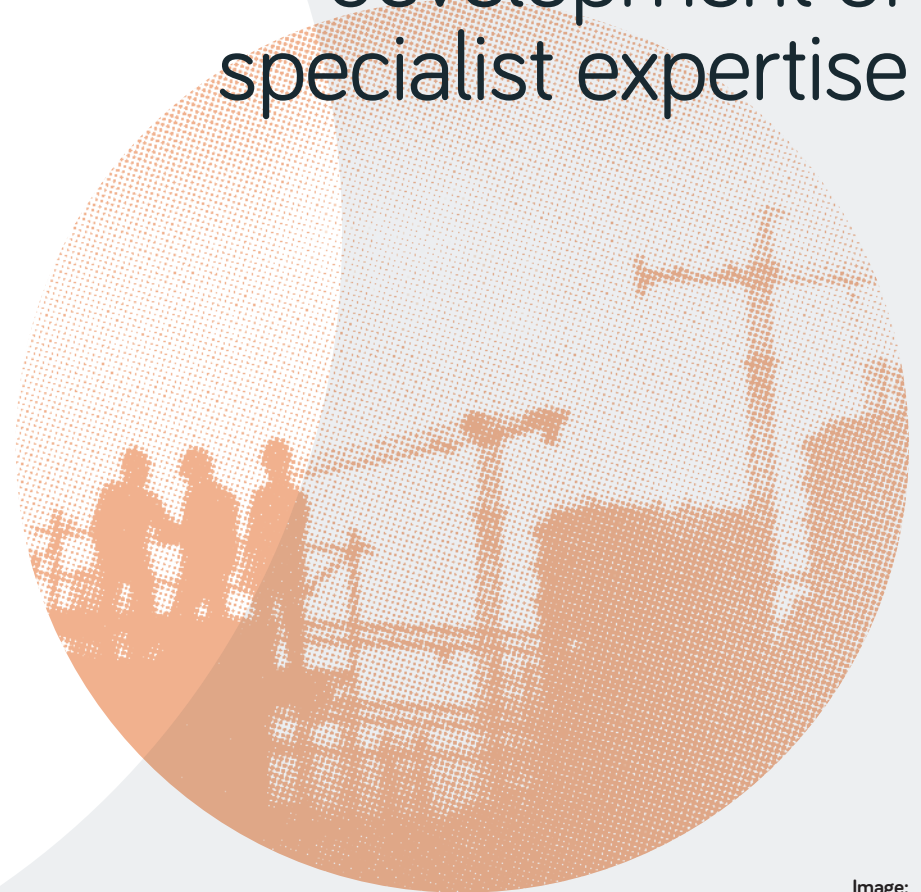
Image: Many architects develop specialisms within design and construction.

Breadth and flexibility to facilitate the development of specialist expertise