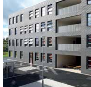
RIBA Award Winners 2014