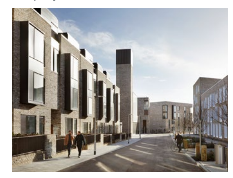
Eddington A central energy centre is a distinctive element which references the tradition of Cambridge chimneys, giving a strong identity to the scheme.